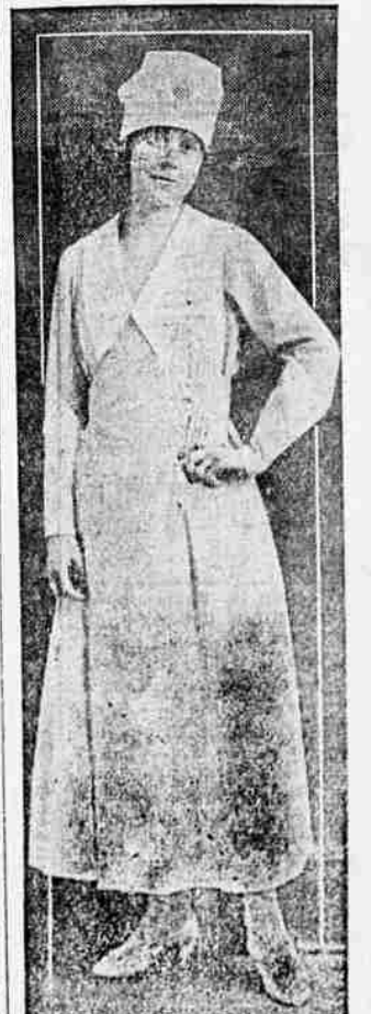
Official uniform of the Food Conservation section of Food Administration. Pattern may be obtained by mailing ten cents to Food Administration, Washington, D. C.