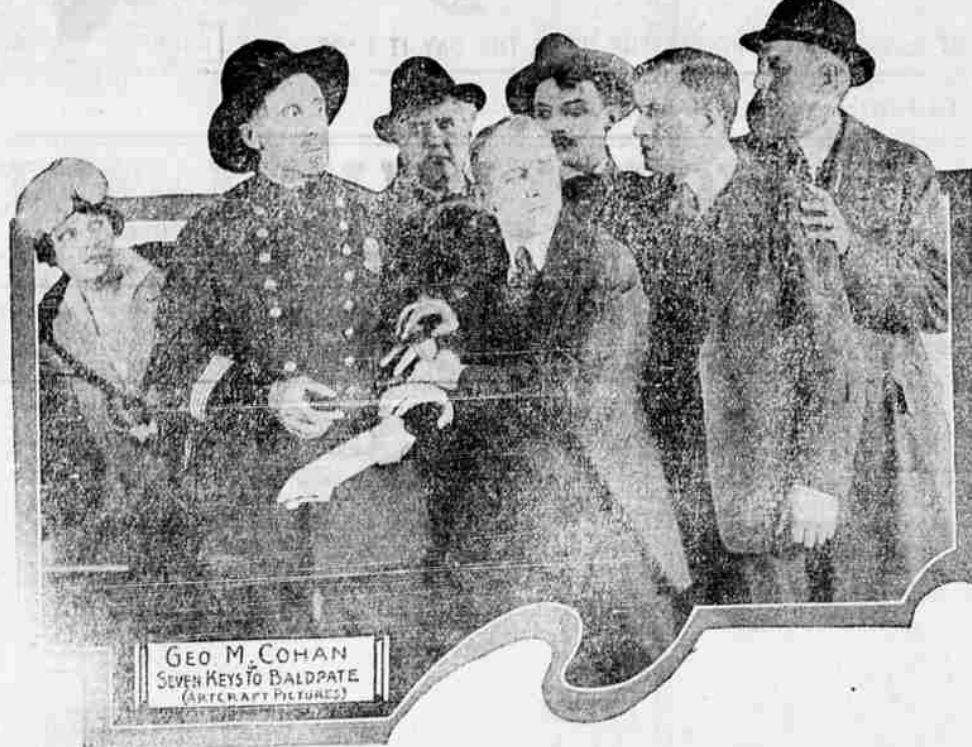
GEO. M. COHAN SEVEN KEYS TO BALDPATE (ART-CRAFT PICTURES)

George Washington Magee, a novelist, makes a wager with the owner of Baldpate Inn that he can write a story in 24 hours. Seeking seclusion, Magee borrows the key to Baldpate, a summer hotel now locked up for the winter, and with his typewriter retires to an upper room of the deserted hostelry to write his story. There enters the hotel office one John Bland, an employe of a street railway magnate, who places $200,000 in the hotel safe—a bribe to be called for later by the Mayor of Reuton. Magee surprises Bland, who draws a pistol, but a moment later the novelist tricks him and locks him in a room. Forthwith, however, Magee is confronted by a third intruder, Mary Norton, a newspaper reporter on the trail of the bribery affair. Magee falls in love with Mary and complications crowd still more closely upon one another's heels. In all, seven persons, includ-