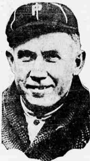
PAT MORAN.

In the National league there is probably no better liked man than Pat Moran, manager of the Philadelphia team. Taking charge of a loser in 1915, Manager Moran won a pennant for the