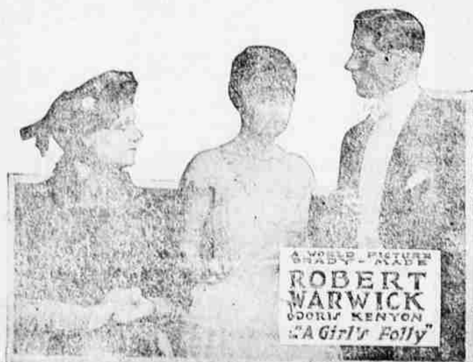
ROBERT WARWICK DORIS KENYON "A Girl's Folly"