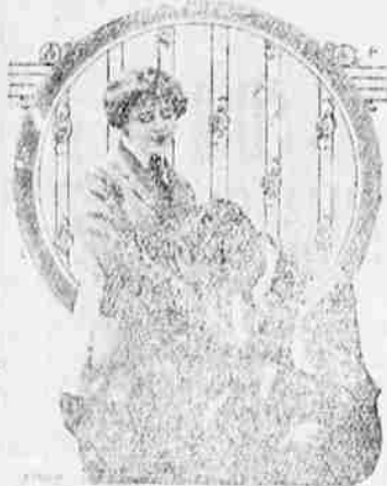
MARGUERITE CLARK at the Arcade today and tomorrow

MARGUERITE CLARK AT THE ARCADE TODAY AND TOMORROW