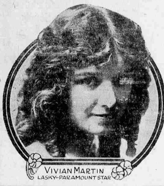
VIVIAN MARTIN LASKY-PARAMOUNT STAR

Classified ads solve your want problems.