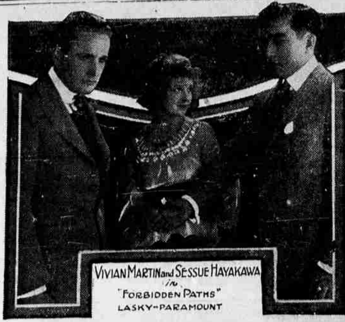
VIVIAN MARTIN and SESSUE HAYAKAWA "FORBIDDEN PATHS" LASKY-PARAMOUNT