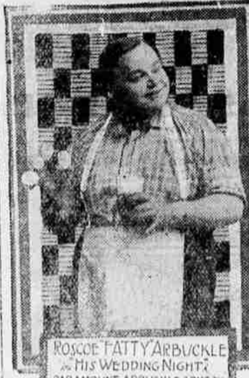
ROSCOE FATTY ARBUCKLE "HIS WEDDING NIGHT" PARAMOUNT-ARBUCKLE COMEDY

One of the most amusing scenes is where she makes her entrance on a ballroom floor on roller skates, much to the dismay of her parents. Mother and sister are angling for an English nobleman who is traveling incognito.