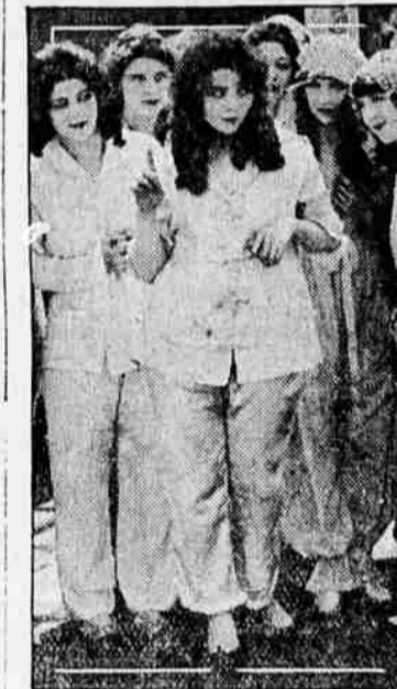
Olive Thomas in Triangle Play, "Madcap Madge."