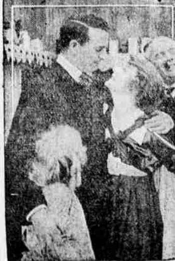
Triangle Play at Star, Tomorrow