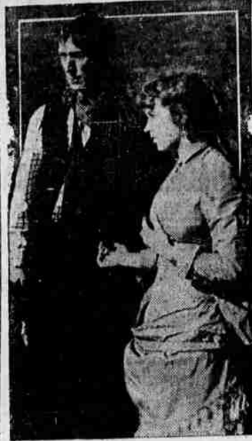
William S. Hart, in Triangle Play, "The Square Deal Man."