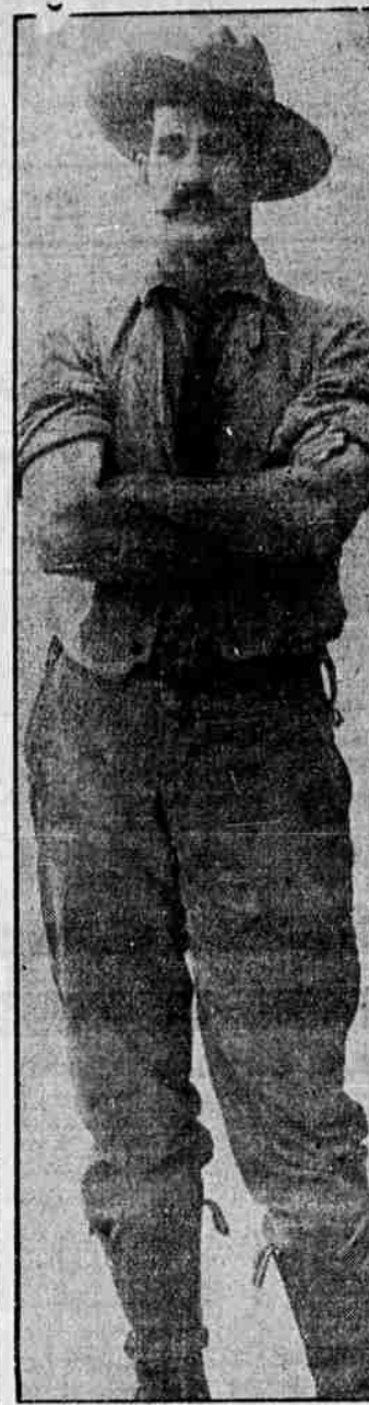
The Forest Ranger in "The Eyes of the World."

World" at the Arcade theatre on Sunday will take on special authority by reason of the fact that Harold Bell Wright, the author of the book which has broken all records as "best sellers," with a sale of over a million copies, had an active personal hand in the work of interpreting his characters for the screen.