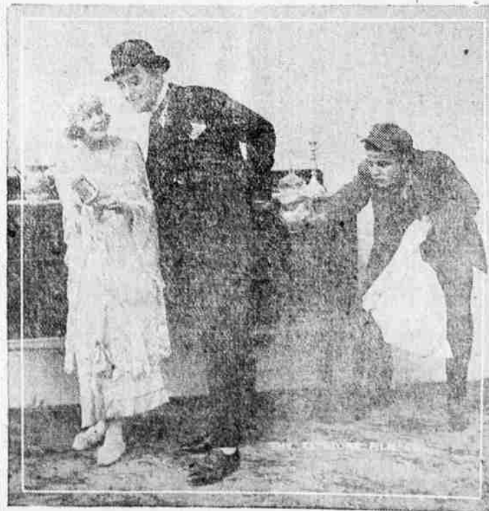
SCENE IN MACK SENNETT-KEYSTONE COMEDY, "PINCHED IN THE FINISH." COMING TO THE ARCADE THEATRE