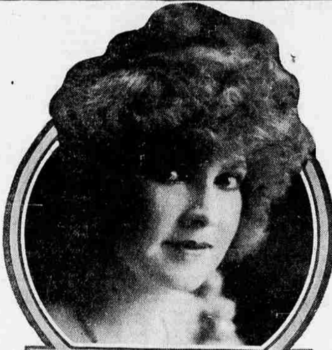
FANNIE WARD LASKY-PARAMOUNT STAR

THE DIAMOND BRAND. Lead! Ask your Druggist for Chichester's Diamond Brand Pills in Red and Gold metallic boxes, sealed with Blue Ribbon. Take no other. Buy of your Druggist. Ask for CHICHESTER'S DIAMOND BRAND PILLS, for 32 years known as Best and Always Reliable. SOLD BY DRUGGISTS EVERYWHERE.