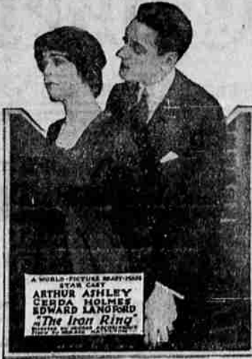
AT THE ARCADE THEATRE

If the bowels are not working regularly, undigested food in the stomach may set up a condition of auto-intoxication and pollute the whole system with poisons in the blood stream. Foley Cathartic Tablets keep the bowels open and regular, the liver active and the stomach sweet. They cause no pain, nausea nor griping. They relieve indigestion, sick head-