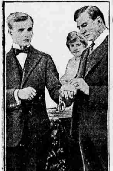
Slipped the Handcuffs Over the Secretary's Wrists.

In that gloomy sanctuary of evils known as the Owl's Nest, Jules Legar bent over the half sheet of paper on which the pen in his lean fingers was inscribing certain cryptic characters. Then he quickly folded the strip of parchment, placed it in an envelope, and securely gummed down the flap with the aid of the iron hook which took the place of his missing left hand. Crossing the dank flagging of the subterranean chamber, he stood before a rat-faced individual, who squinted slavishly up at him with one good eye. Although fortified by liberal portions of the Owl's illicit brew, it was evident that One-Lamp Louie nourished an unwholesome dread of that scar-marked tyrant, who brooked no infraction of his malign authority. "Cut out that booze and listen to me," commanded Legar in curt tones; "you know the place where those bulls from headquarters gave us such a lively run that I had to cache that Van Horn swag. Get out there as quick as you can and turn this envelope over to Dutch Frank, who will be waiting with Tony Raffello along the road near the lake. They will know what to do, and remember—no bungling on this job."