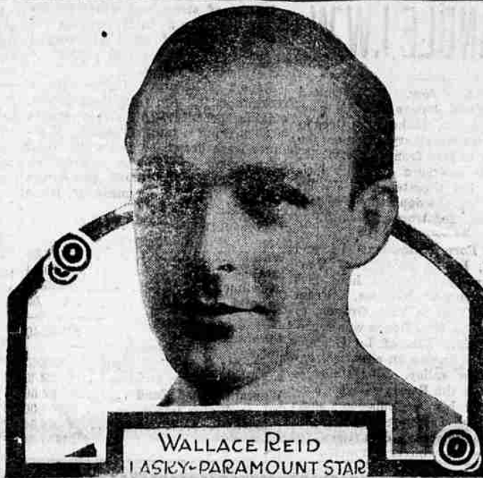
WALLACE REID ASKY-PARAMOUNT STAR