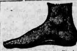
Scholl's Foot-Eazer For Tired, Aching Feet, Cramped Toes, etc.

Germany started the war. England and her Allies did