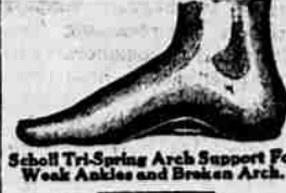
Scholl's Tri-Spring Arch Support For Weak Ankles and Broken Arch.