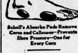
Scholl's Acherbo Pads Remove Corns and Calluses—Prevents Shoe Pressure—One for Every Corn.