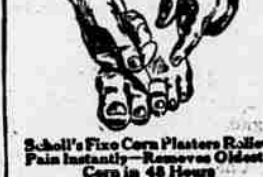
Scholl's Fire Corn Plasters Relieve Pain Instantly—Remove Oldest Corns in 48 Hours.