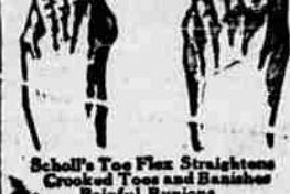
Scholl's Toe Flex Straighteners Crooked Toes and Banishes Painful Bunions.