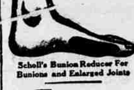
Scholl's Bunion Reducer For Bunions and Enlarged Joints.