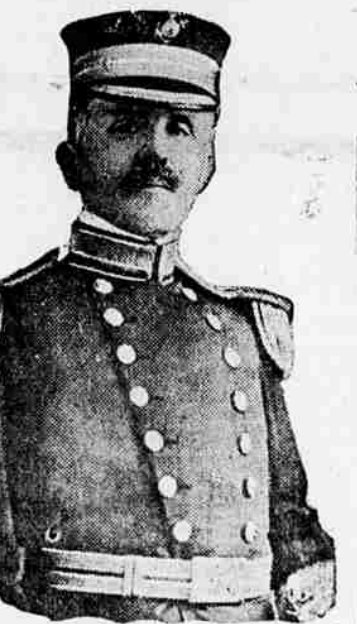
Major General George Barnett, Commander of the Marine Corps.