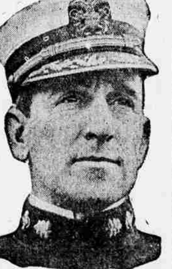
Commander Yates Stirling, Jr.