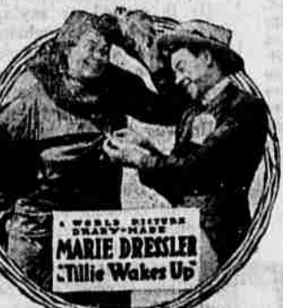
SCENE FROM MARIE DRESSLER'S COMEDY AT THE ARCADE TONIGHT.