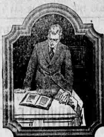
Copyright 1917, A. B. Kirschbaum Co.

HILL'S DEPARTMENT STORE Quality and Service