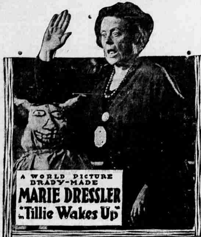
A WORLD PICTURE BRADY-MADE MARIE DRESSLER "Tillie Wakes Up"

Marie Dressler, with an unusually strong cast of fun makers, including Johnny Hines, will be at the Arcade theatre on Wednesday and Thursday in this play. If you are desirous of spending an evening of entire pleasure, and can spend such an evening