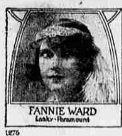
FANNIE WARD Lasky-Paramount