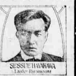
SESSUE HAYAKAWA Lasky-Paramount