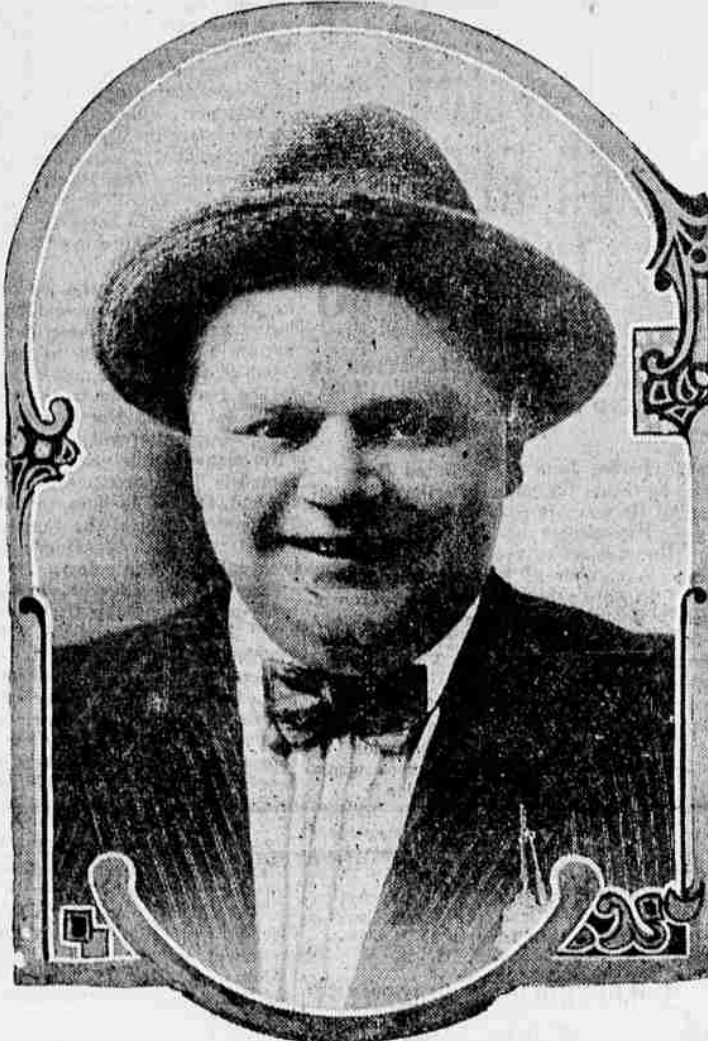
"FATTY" ARBUCKLE, STAR IN PARAMOUNT-ARBUCKLE COMEDIES.

"CLEAN PICTURES FIT FOR CHILDREN" IS THE SLOGAN OF "FATTY" ARBUCKLE.