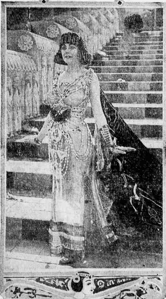
PRINCESS BELOVED in BABYLONIAN SCENE of D.W. GRIFFITH'S INTOLERANCE..