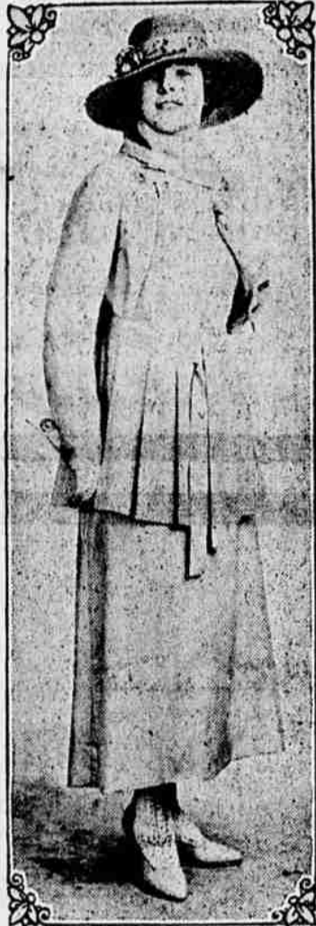
FOR YOUTHFUL FIGURES.

The dressy suit of tussore silk is fea- tured in tau, gold, green, white or rose pink. The coat is plaited back and front, with sash belt, convertible cape