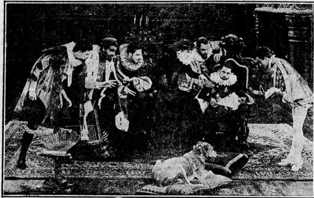
COMING TO ARCADE, SATURDAY AND SUNDAY.