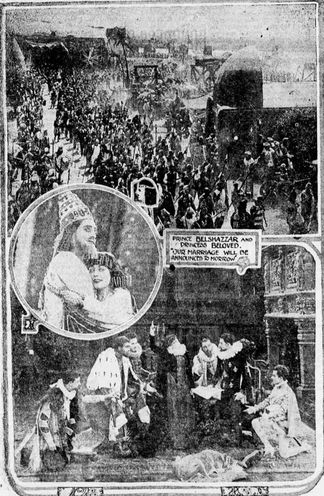
PRINCE BELSHAZZAR AND PRINCESS BELOVED. "OUR MARRIAGE WILL BE ANNOUNCED TO MORROW"