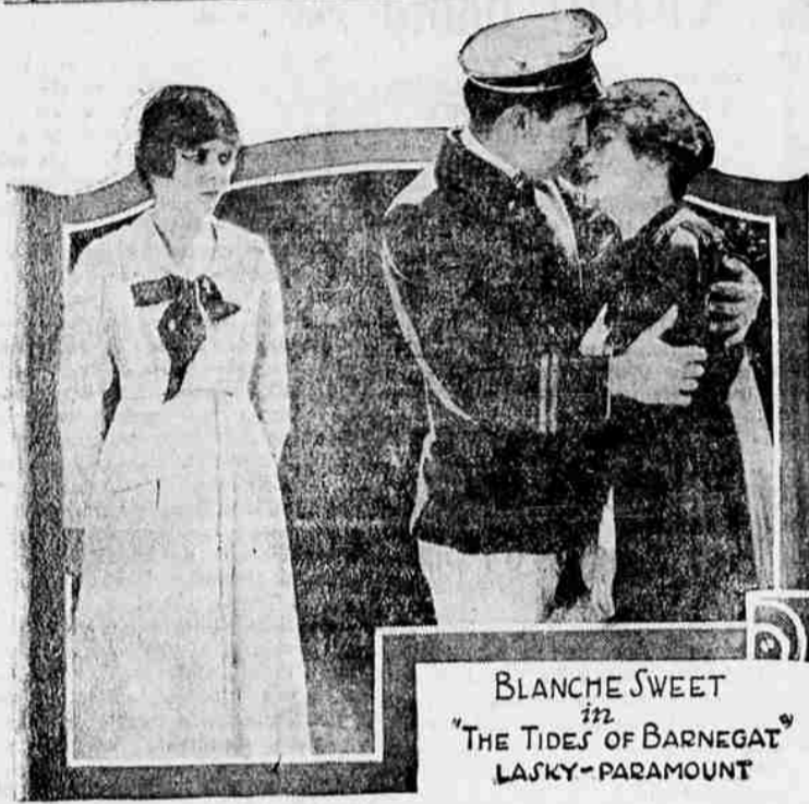
BLANCHE SWEET in "THE TIDES OF BARNEGAT" LASKY-PARAMOUNT

F. Hopkinson Smith, author of "The Tides of Barnegat," was by profession a marine architect, but by choice and talent, a painter and writer. His admirers believe that he was more versatile, and painted better pictures