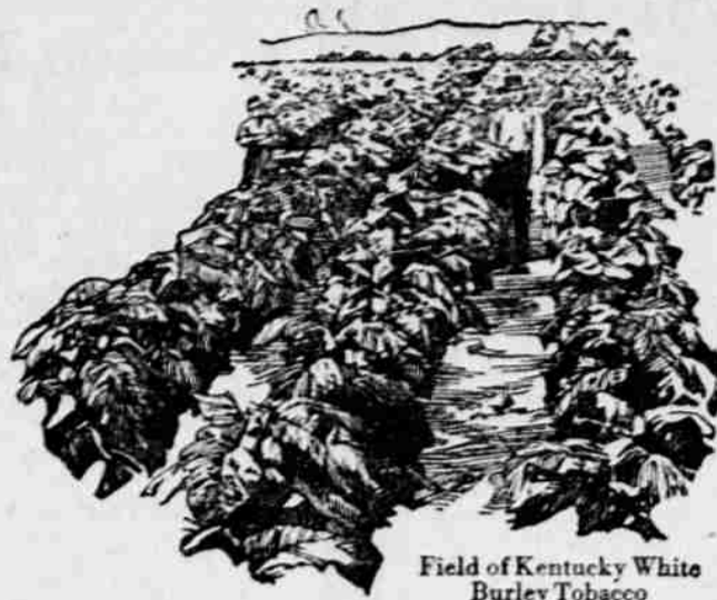
Field of Kentucky White Burley Tobacco