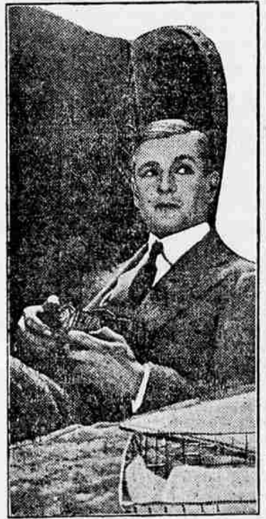
Intently Working Over a Pocket Camera.