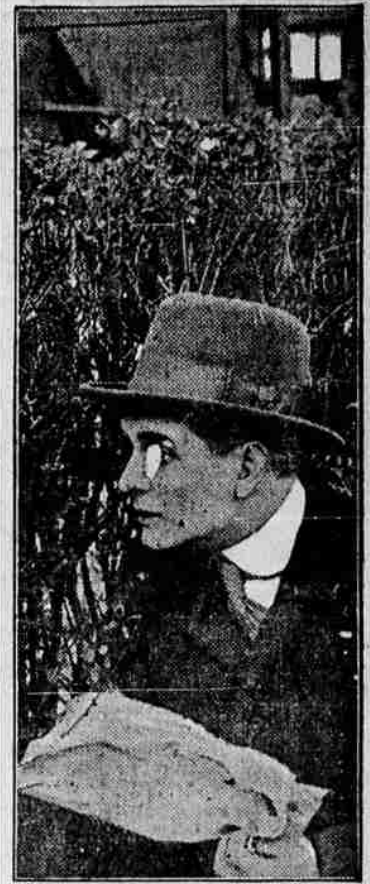
He Slipped Unobserved From the Grounds.

"That's Legar," cried Manley, as he caught sight of the one-armed figure side by side with a bespectacled German striving and fighting to push shut the intervening door. But the fallen man's body lay in the way, and