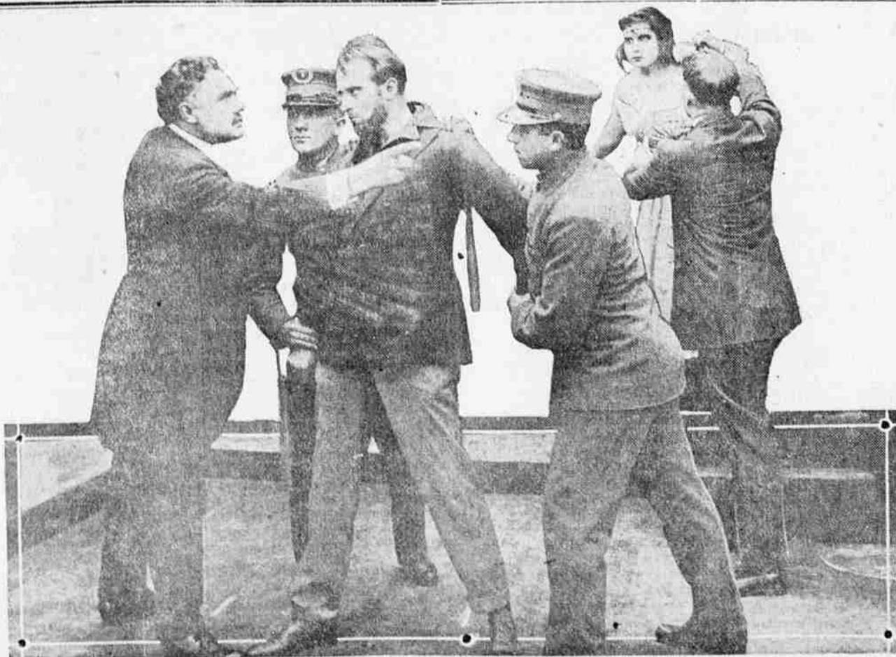
ARCADE—TODAY AND TOMORROW—"THE VAGABOND PRINCE".

Worms drain the strength and vitality of children, making them dull and listless. Their power to resist more serious diseases is reduced and energy and interest in play is lacking. Kickapoo Worm Killer is a mildly laxative remedy in candy tablet form that children like to take. It kills and removes the worms and lets your child grow strong and healthy