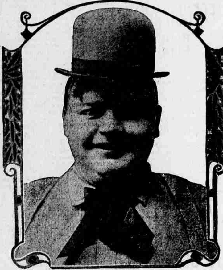
"FATTY" ARBUCKLE, STAR IN PARAMOUNT-ARBUCKLE COMEDIES

Special U. S. Marines Film Tonight. "The Peace Makers" will be shown at the Arcade tonight. This film is supplied by the U. S. Marine Corps. This is a wonderful picture showing our boys in action. To the many who have friends and sons in the Marine Corps, and others who have not but are interested, this picture will be a great enlightenment. There will be two reels of this wonderful picture. Bring the children and all the family to see this instructive picture of the U. S. Marines in action.