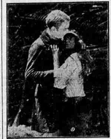
Scene from "20,000 Leagues Under the Sea."

Do you know that U. S. Marines were the first troops to enter Peking, China, just before the Boxer Rebellion in 1900? Do you know that U. S. Marines were the first troops to enter Vera Cruz in April, 1914? Do you know that a Marine serves on both land and sea? Do you know that U. S. Marines have carried their Flag into action in Tripoli, Egypt, West Africa, the Fiji Islands, Sumata, Hawaii, Mexico, China, Uruguay, Paraguay, Alaska, Panama, Formosa, Korea, Nicaragua and Cuba. Do you know that they are now pacifying Haiti and Santo Domingo? Do you want to see them action? If you do, come to the Arcade theater tonight and see them in action in Haiti and Santo Domingo. The only picture ever taken of "Our Boys" in actual fighting.