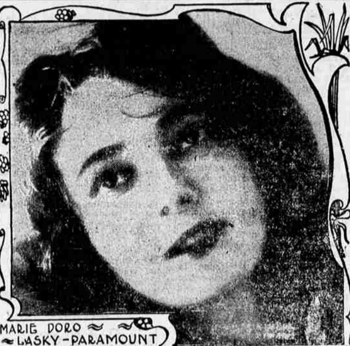
MARIE DORO ~ LASKY-PARAMOUNT

Residence 1703 Second St. Phone Black 481