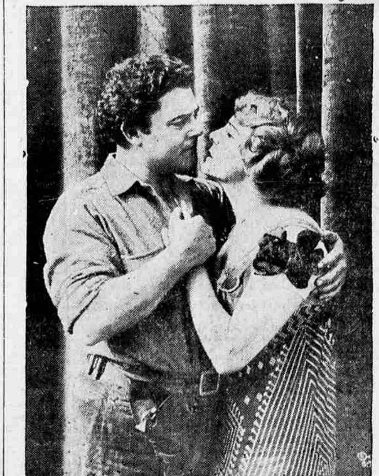
SCENE FROM "THE SPOILERS" AT SHERRY'S TODAY AND TOMORROW