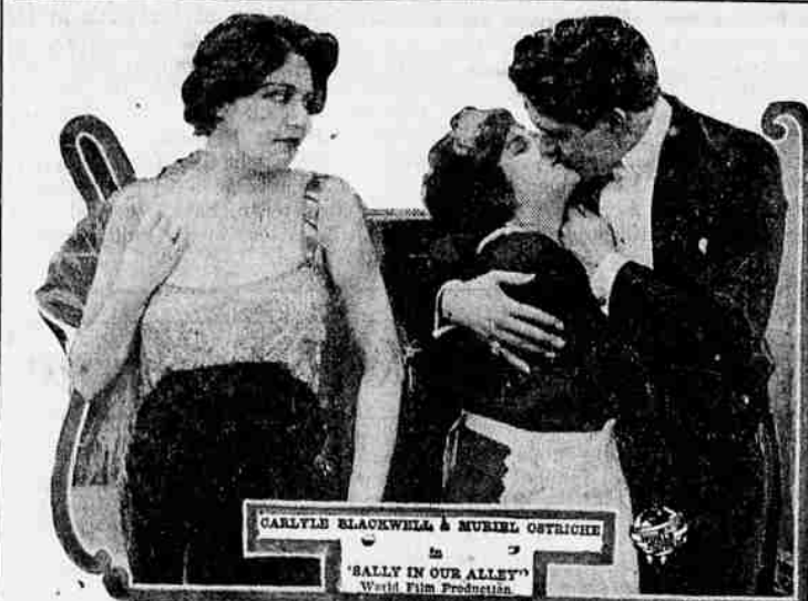
SCENE FROM FILM DRAMA AT THE ARCADE SUNDAY ONLY