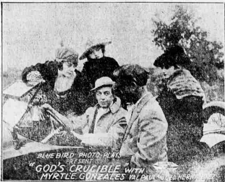
COLONIAL TODAY AND TOMORROW.