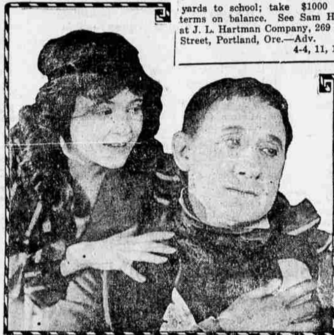
SCENE FROM "FORTUNES OF FIFI" ARCADE TODAY AND TOMORROW

Through the influence of the veteran, Fifi obtains employment at the Imperial where she soon becomes the