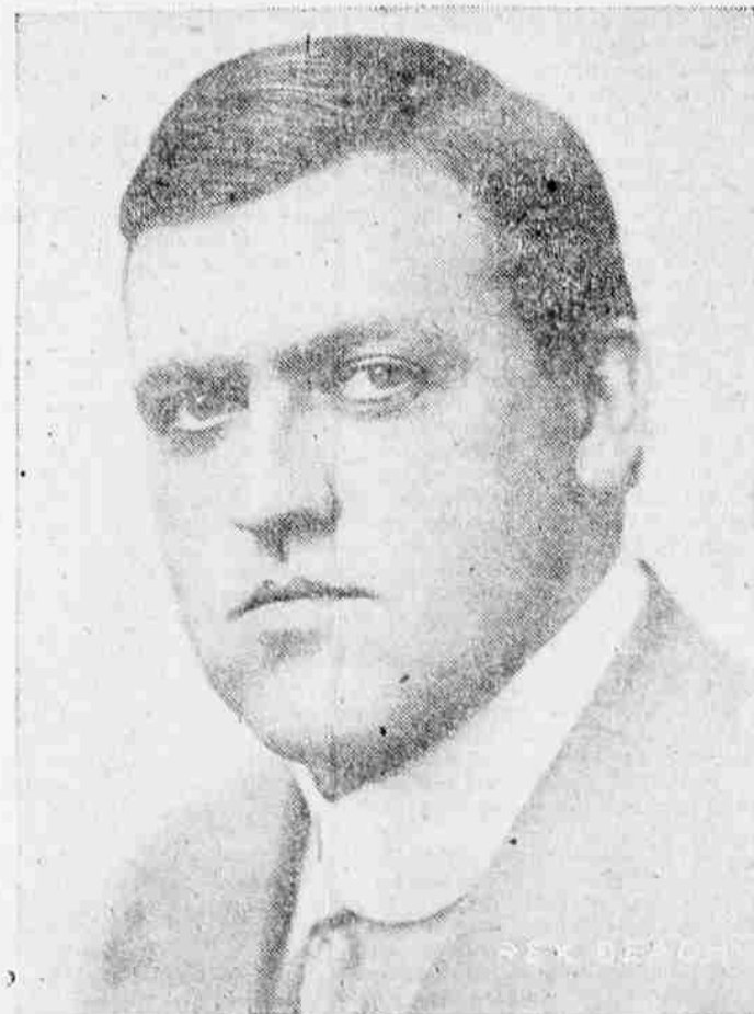
REX BEACH, AUTHOR OF "THE SPOILERS."

A paint dealer naturally is called upon to be familiar with all the various materials useful in the decoration of the Home.