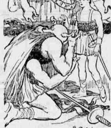
One of the Big Six Serials

H. G. Wells and Jules Verne Outdone * * * * * Read About the Plant Men, the Green Men and the Black Pirates of Mysterious Barsoom * * * * *