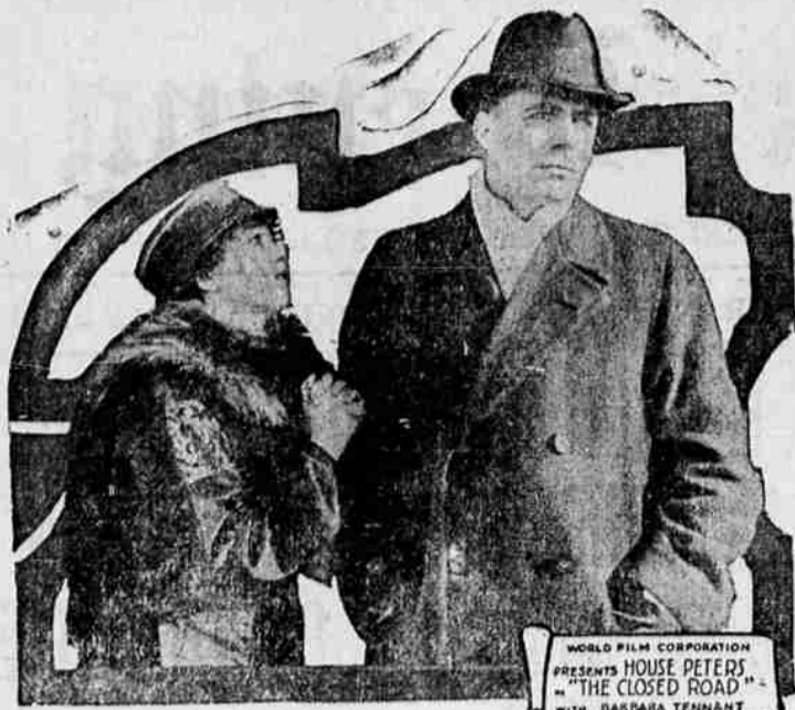
SCENE FROM "THE CLOSED ROAD" AT THE ARCADE TODAY.

HILL'S DEPARTMENT STORE Quality and Service