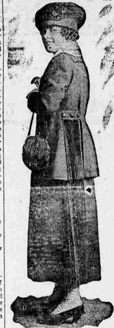
JUST FOR WEAR.