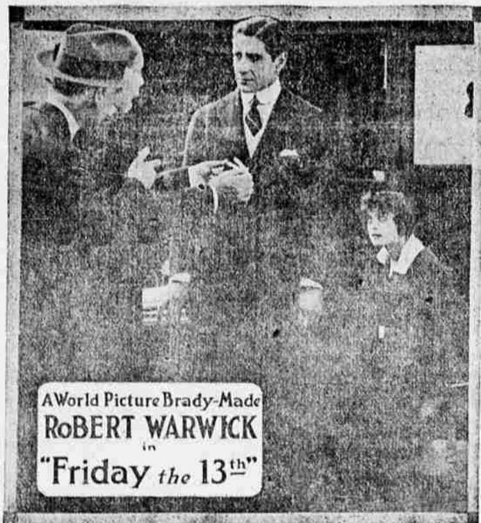
A World Picture Brady-Made ROBERT WARWICK in "Friday the 13 th "