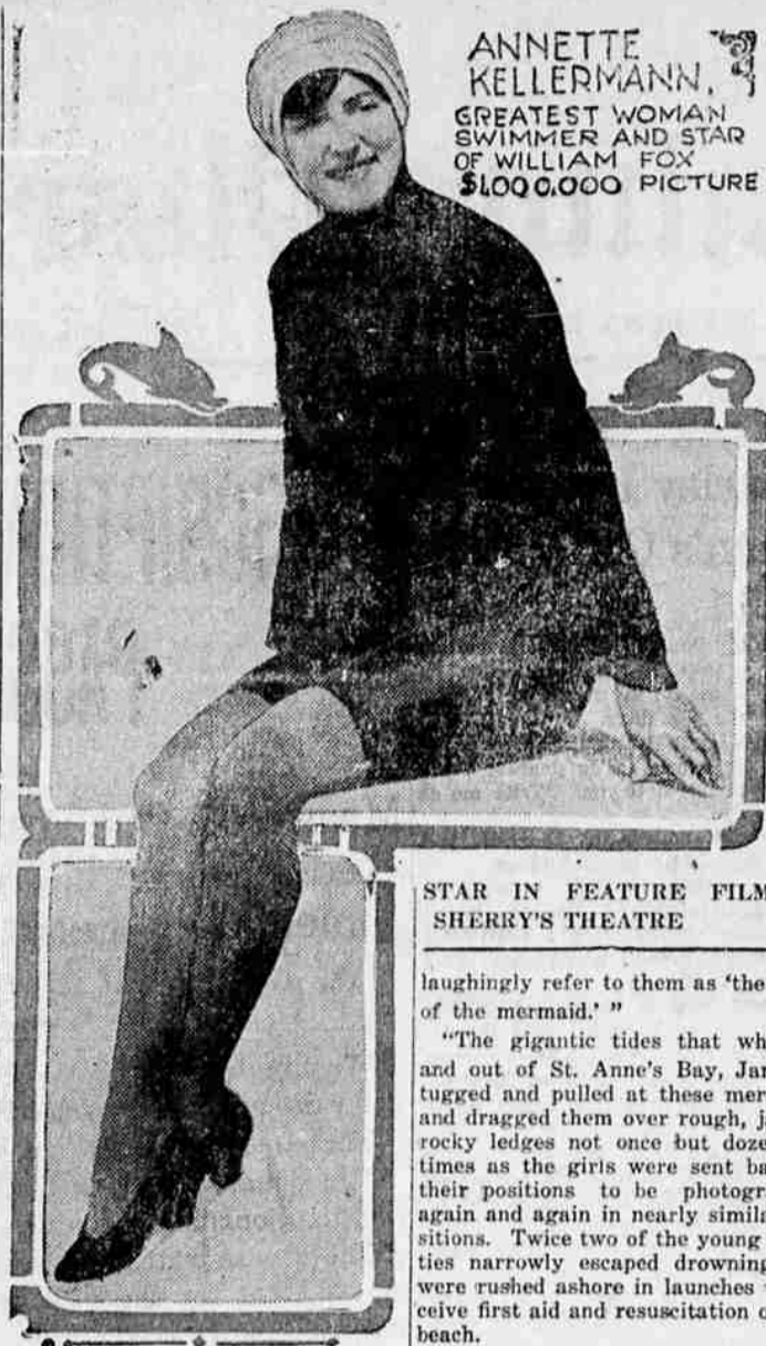
ANNETTE KELLERMANN. GREATEST WOMAN SWIMMER AND STAR OF WILLIAM FOX $1,000,000 PICTURE

In swimming the real motive power is derived from the outward kick of the legs, the arms merely serving to keep afloat the upper portion of the body. A mermaid having her lower limbs immovably encased in a tail appendage of glistening scales is deprived of the propulsion so essential to a swimmer; and only by long and continued practice can this difficulty be overcome. Put a swimmer thus