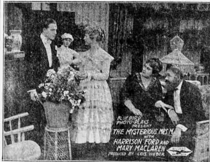
BLUEBIRD PHOTO PLAYS PRESENT THE MYSTERIOUS MRS. M. WITH HARRISON FORD AND MARY MACLAREN PRODUCED BY LOIS WEBER