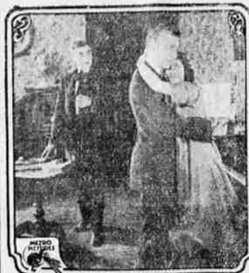
SCENE FROM "THREADS OF FATE"

had a part that was better suited to her personality and charms than that of Dorothea.