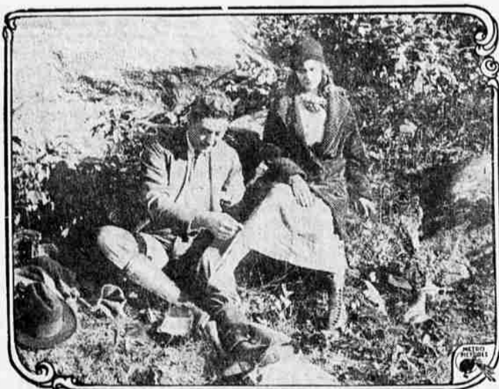
SCENE FROM "THREADS OF FATE"