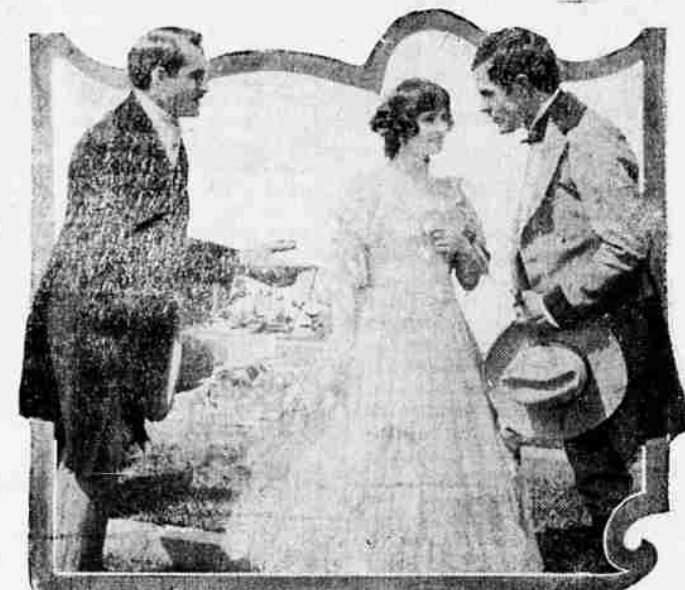
PEGGY HYLAND and ANTONIO MORENO in "ROSE OF THE SOUTH"

The next scene shows her leaving the room with the man carrying the