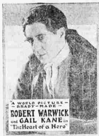
A WORLD PICTURE - BRADY-MADE - ROBERT WARWICK and GAIL KANE in "The Heart of a Hero"

American patriot's entire ill-fated career. After seeing the picture "The Heart of a Hero," you will forever after associate the name of Robert Warwick with Nathan Hale—so vivid a characterization of the patriot does he draw. You will more thoroughly realize what a wonderful sacrifice it must have been for him to leave his sweetheart who is Gail Kane in the play.