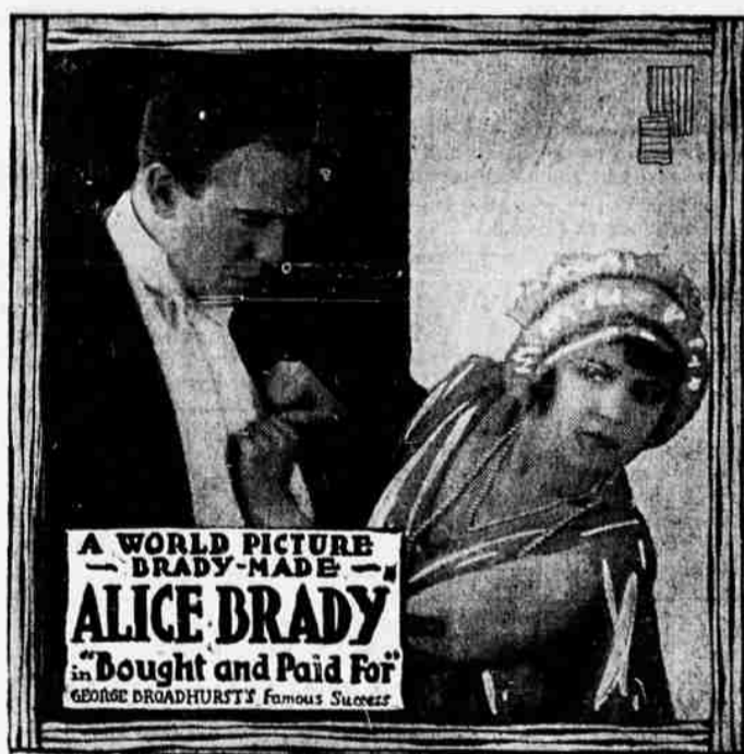
A WORLD PICTURE — BRADY-MADE — ALICE BRADY in "Bought and Paid For" GEORGE BROADHURST'S Famous Success

the "boys," a good fellow as in his bachelor days, returning home debased from drink and carousing. On these occasions, Virginia's sensitive nature rises in revolt and she hates the brutish, passionate man whom she can scarcely recognize as the husband of those first happy days.