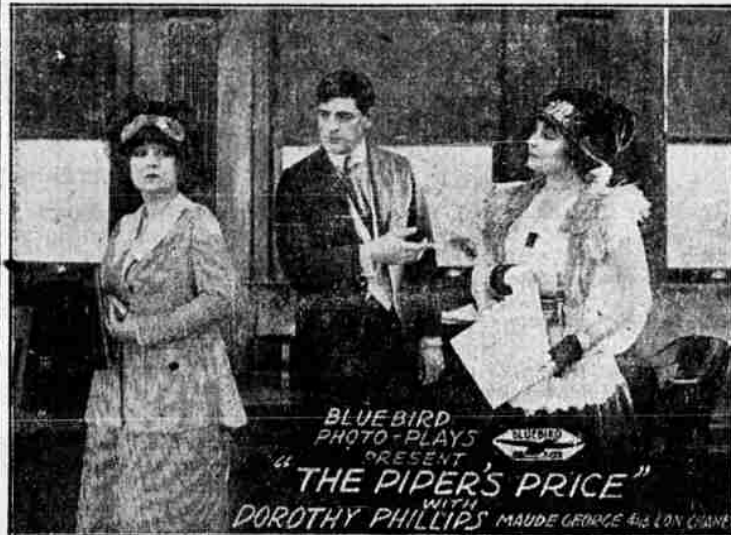
BLUE BIRD PHOTO-PLAYS PRESENT "THE PIPER'S PRICE" WITH DOROTHY PHILLIPS MAUDE GEORGE AND LON CHAMBERLAIN

For the evil we do we must pay, right here on earth, is another way of saying that we cannot escape our just deserts. This is proven through convincing dramatic construction in "The Piper's Price," to be the attraction at the Sherry theater today and tomorrow with beautiful and talented Dorothy Phillips playing the leading role.