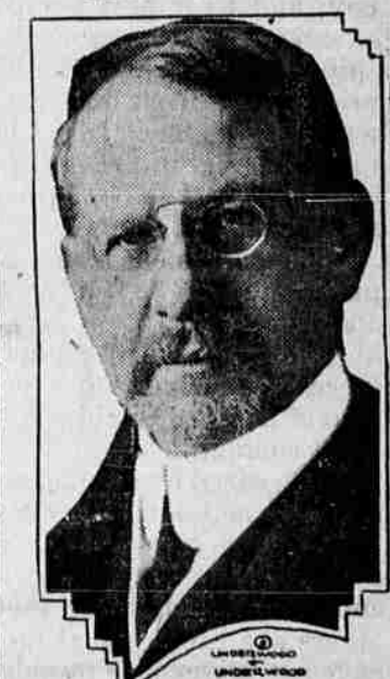
ADRAM ELKUS. President Wilson appointed Elkus ambassador to Turkey in 1916. He succeeded Henry Morgenthau. Stiff, Sore Muscles Relieved.

Cramped muscles or soreness following a cold or case of gripple are eased and relieved by an application of Sloan's Liniment. Does not stain the skin or clog the pores like mussy ointments or plasters and penetrates quickly without rubbing. Limber up your muscles after exercise, drive out the pains and aches of rheumatism, neuralgia, lumbago, strains, sprains and bruises with Sloan's Liniment. Get a bottle today. At all druggists, 25c.