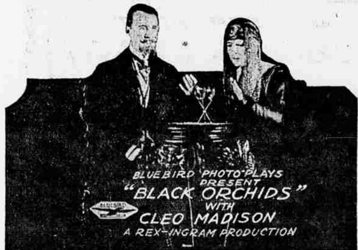
BLUEBIRD PHOTOPLAYS PRESENT "BLACK ORCHIDS" WITH CLEO MADISON A REX-INGRAM PRODUCTION