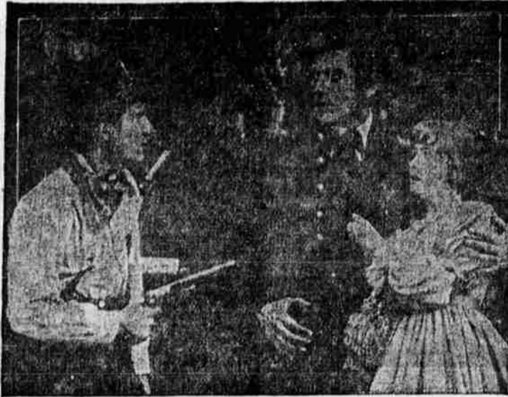
DOROTHY GISH IN TRIANGLE-FINE ARTS PLAY, "THE LITTLE YANK."