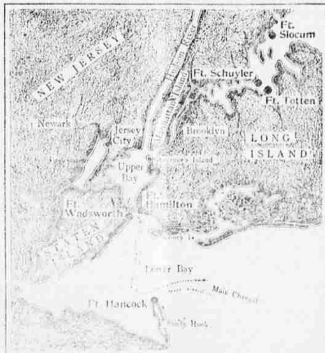
The map shows New York harbor. Besides these defenses, several fast destroyers are patrolling our three-mile limit, off New York harbor.