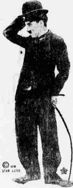
In a Return Engagement of "THE FLOOR-WALKER"

A new sink strainer has a revolving center plate that can be closed over its holes to retain water in a sink.