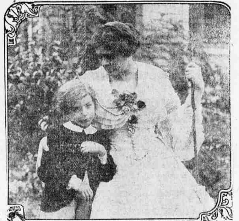
SCENE FROM "THE AWAKENING OF HELENA RICHIE"