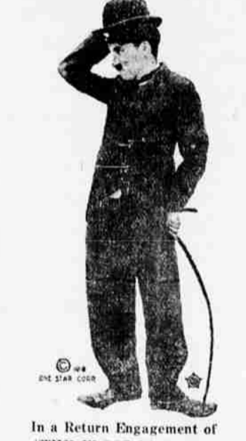
In a Return Engagement of "THE FLOOR-WALKER"

A British patent covers a series of tanks attached to a cable to permit a vessel to spread oil on rough water.