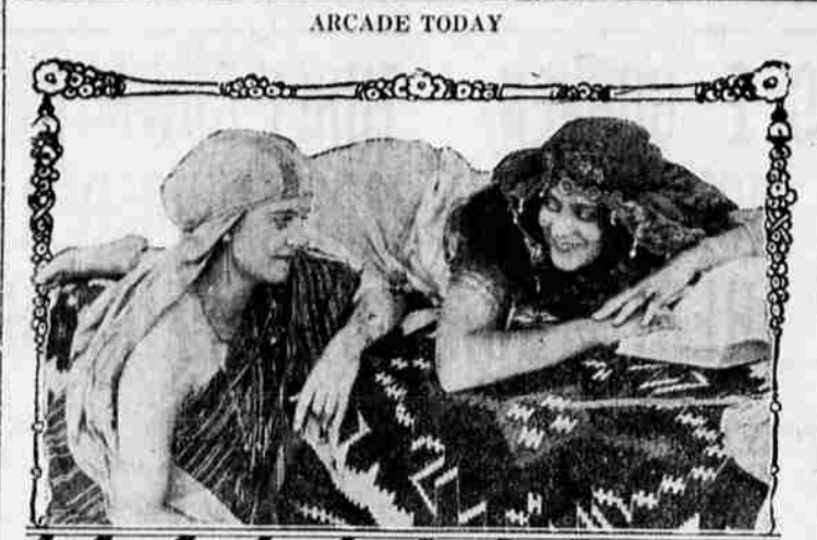
LENORE ULRICH IN "THE ROAD TO LOVE" THE OLIVER MOROSCO PHOTOPLAY CO.

LENORE ULRICH AT ARCADE Many types and kinds of Oriental dancing are performed by the native dancing women in Lenore Ulrich's new Morosco-Paramount photoplay "The Road to Love." The scenes of the Fantasia, which play so important and critical a part