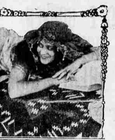
LENORE ULRICH IN "THE ROAD TO LOVE" THE OLIVER MOROSCO PHOTOPLAY CO.

This native supplied the Algerian dancers, musicians, camel drivers and all the strange equipment of these people. The sight of these desert dwellers at their accustomed tasks creates an air of genuineness that adds an Oriental flavor to this strongly attractive love story of the near east.