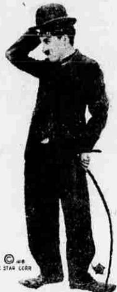
In a Return Engagement of "THE FLOOR-WALKER"

ing even the remotest connection on a highly efficient basis.