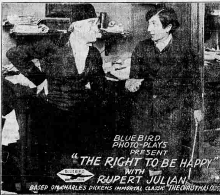
BLUE BIRD PHOTO-PLAYS PRESENT "THE RIGHT TO BE HAPPY" WITH RUPERT JULIAN BASED ON CHARLES DICKENS IMMORTAL CLASSIC "THE CHRISTMAS CAROL"